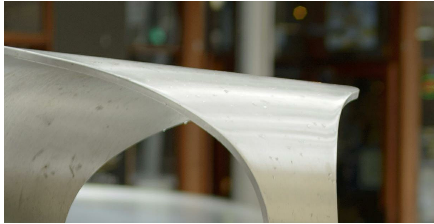
Semi-polished 316 Stainless Steel Cladding (smooth finish)