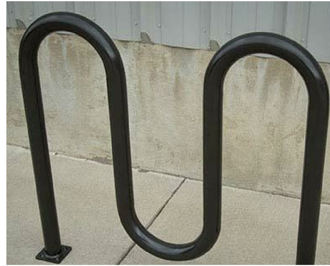
Satin black powder coated aluminium frame