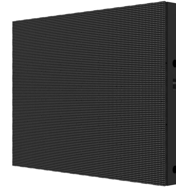
LED digital display screen